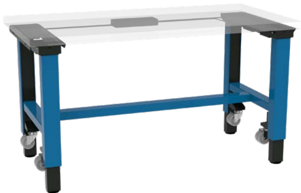
move X2 Mobile Mobile version with caster set and crossbar