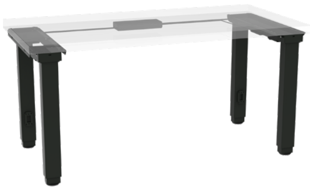
move X2 Basic Basic version with two legs (4 lifting columns)