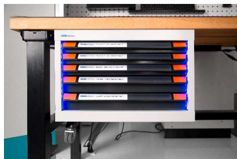
SmartBox in detail